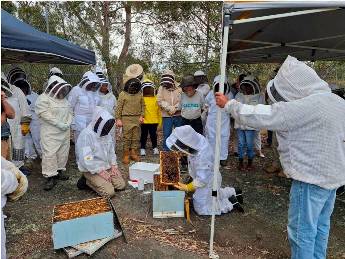
Image: Participants at the Gippsland Field Day in Bengworden.